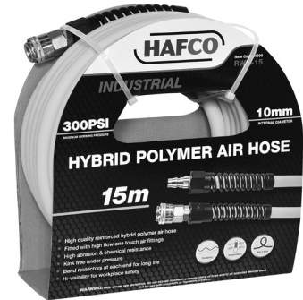
RWK-15 - INDUSTRIAL POLYMER AIR HOSE 15 METRE x Ø9.5MM ID HOSE ORDER CODE H008 RWK-30 - INDUSTRIAL POLYMER AIR HOSE 30 METRE x Ø9.5MM ID HOSE ORDER CODE H009