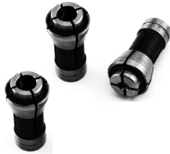
COLLETS 3MM ORDER CODE A04225 6MM ORDER CODE A04226 1/4" ORDER CODE A04227