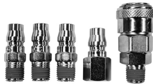
5 PIECE PACK - HIGH-FLOW AIR FITTINGS 1/4" BSPT ORDER CODE F935